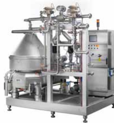
Dairy - Milk separator with automatic milk and cream standardization system